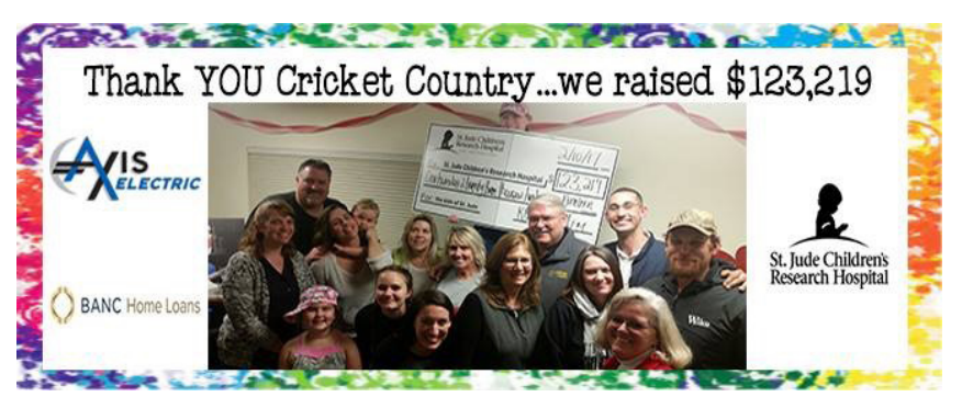
Final Check and group photo for St Jude

We had a fun time at the St. Jude Children's Research Radiothon hosted by our friends at KRKT Cricket Country. The Radiothon brought in.....drum roll please.....a whopping (and new record breaking) total of $123,219.00. Love to hear positive things happening for St. Jude.