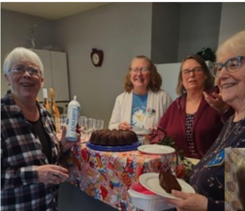
Happy Birthday Delta Xi